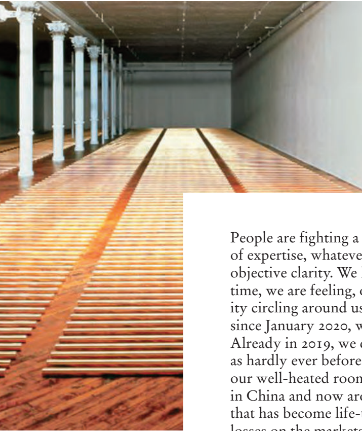
Walter De Maria: The Broken Kilometer , 1979, 500 solid brass rods, each 5 cm diameter and 2 meters long. Dia Center for the Arts, New York, at 393 West Broadway